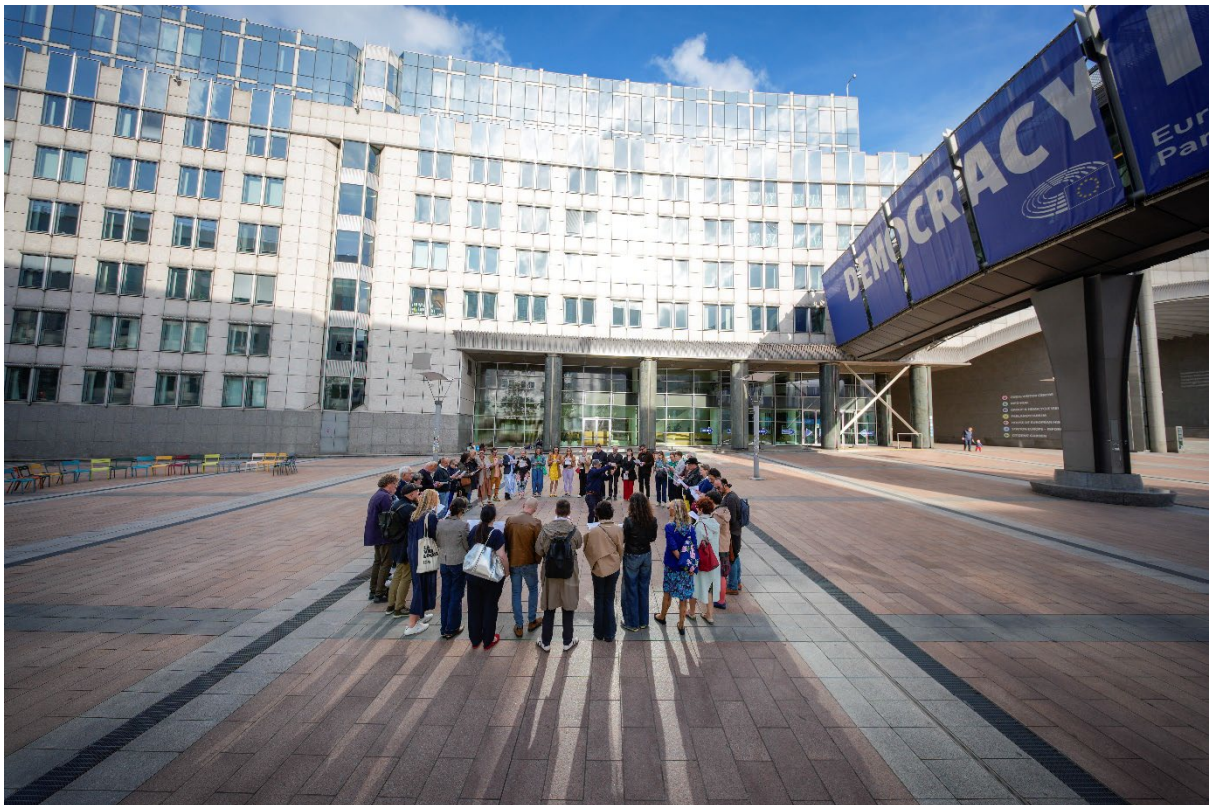
The present delegates of the EWC member associations from all over Europe are reading the statement in a public action in front of the European Parliament in Brussels, 13 th June 2026.

The Statement was adopted by the EWC member associations at the EWC AGM, 14 th June 2026, in Brussels.